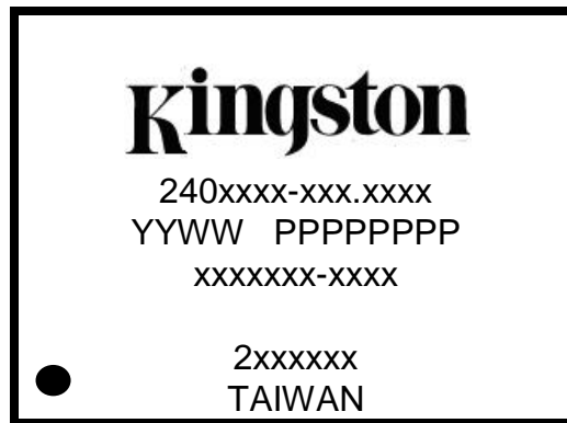
Figure 4 - EMMC Package Marking