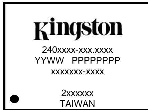
Figure 4 - EMMC Package Marking