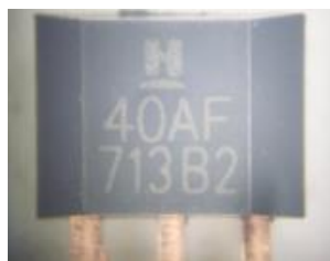
Photograph of new marking

For additional product materials, please visit the First Level Magnetic Sensor IC product webpage at https://sensing.honeywell.com/sensors/position-sensor-ics .