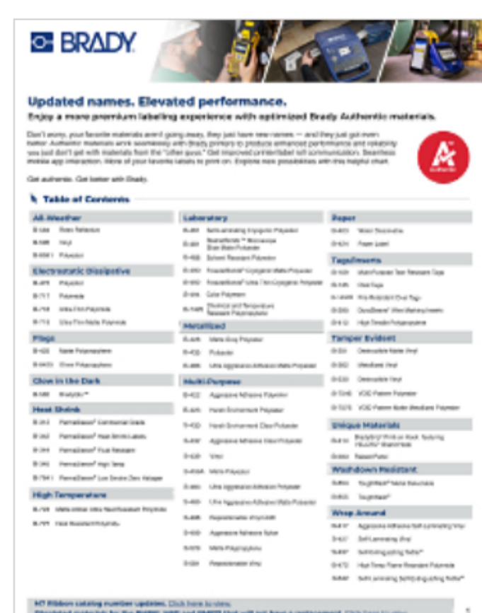
Material Conversion Sheet