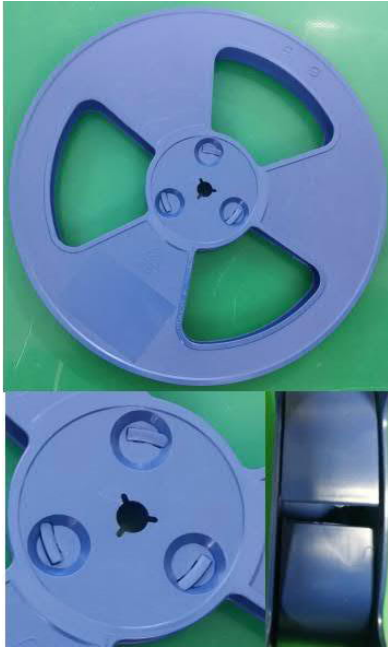
Current: Buckle assembly type