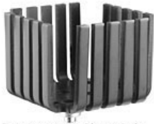
Representative Photo Only

Square basket heat sink featuring straight fins