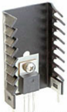
Representative Photo Only

TO-220, TO-220-single gauge (0.020"), Board Level