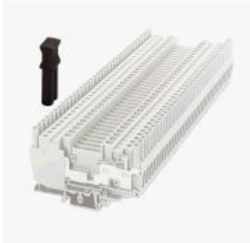
Short circuit plug